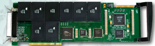
Balder-8U-PCI 8 Access ISDN BRI U-Interface PCI Adapter